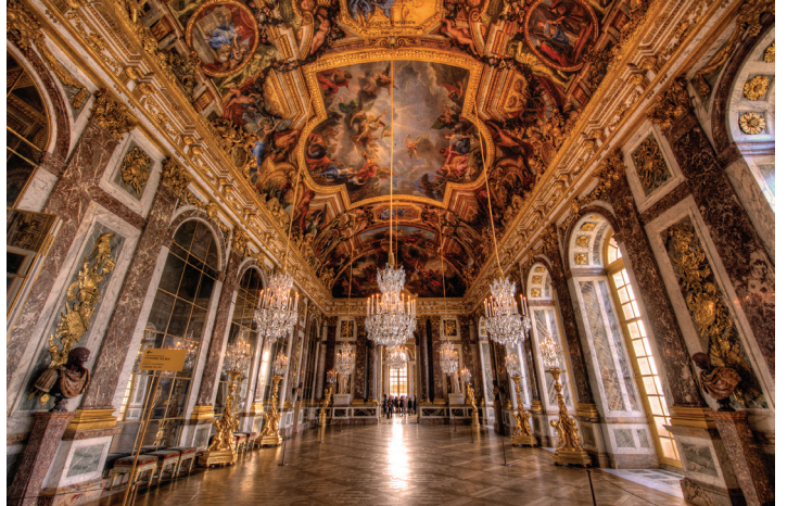
Palace of Versailles - Hall of Mirrors